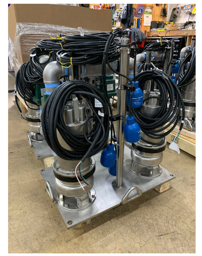
Sump pump package with two Ebara® Dominator stainless steel submersible sewage pumps, fabricated steel mounting/lifting plate, and float switches for drop-in installation in a drainage sump