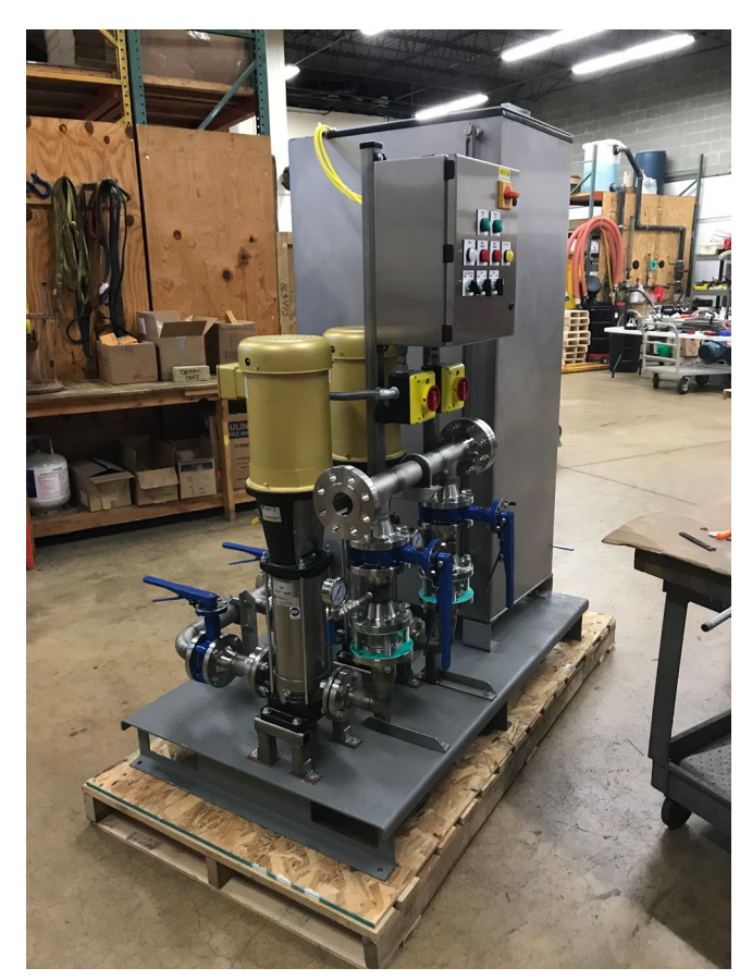
Water reclamation system with two Ebara® EVMSU vertical multistage pumps, fabricated stainless steel tank with level controls, control panel with disconnects, mounted to a fabricated steel base plate to fit through a customer-specified door entrance