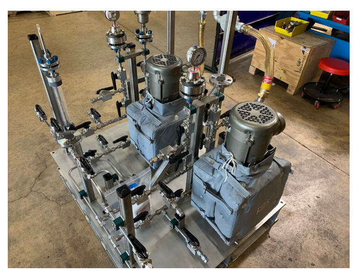
Chemical additive skid with two Milton Roy® mRoy™ series pumps, stainless steel tubing, explosion-proof motors and control panel, and custom-fit insulating pump jackets