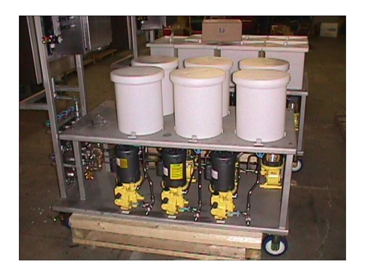
Food additive package with Milton Roy® mRoy metering pumps, control panel, and tanks mounted on a stainless steel cart