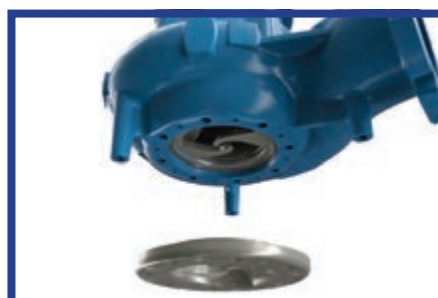
Field replaceable blades