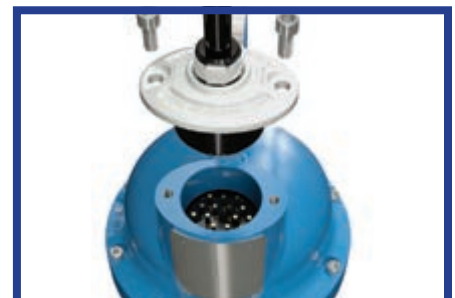
Plug-n-play quick connect cord