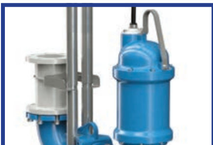
Numerous options, kits & accessories