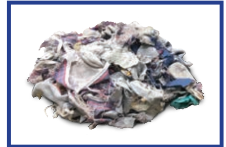
Solids size reduction to 1" to 3" prevent clogging of down-stream component