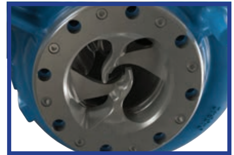
Unique, patented open center cutter mechanism