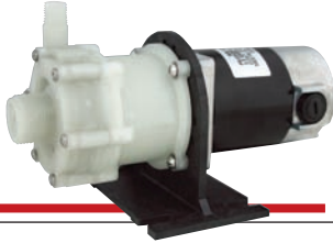
MODEL BC-2CP-MD Brush